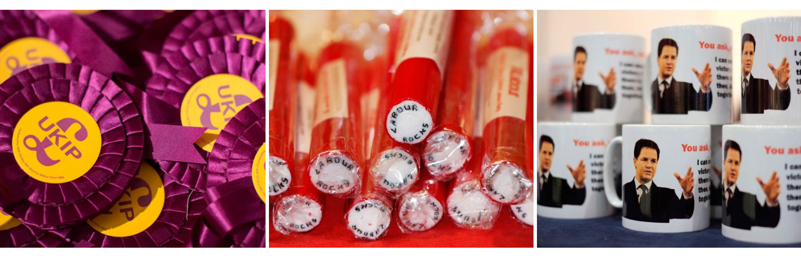
PARTY FAVOURS: Electoral tokens for UKIP, Labour and the Liberal Democrats. Neither the tax authority nor the finance ministry would say why no income tax is charged on political donations made by private companies.

of a "grey area" in tax law. "It's a quirk of the way the system works at the edges, rather than something more deliberate," he said.