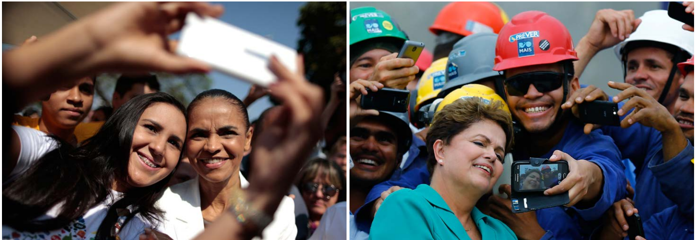
CAMERA READY: Silva (L) and Rousseff (R) take 'selfies' with supporters during separate campaign events. Rousseff is leading Silva among voters of African descent.