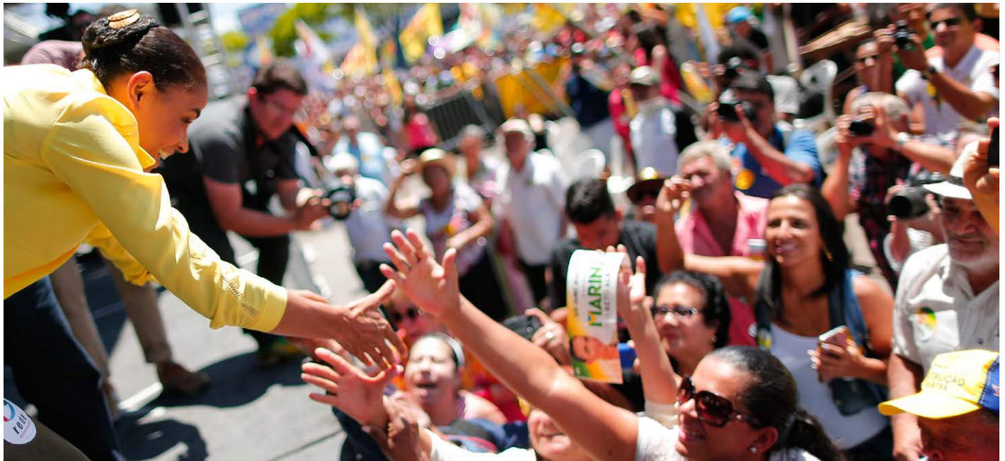
GLAD-HAND: Silva (L) greets supporters during a campaign rally in Ceilandia, a neighborhood on the outskirts of Brasilia.

Party rule, but still less than their share of the population.