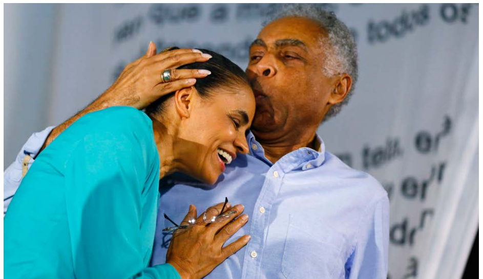
SAY IT WITH MUSIC: Silva's official campaign song, unveiled last month by Gilberto Gil (pictured), probably Brazil's most famous contemporary black musician, praises her "brown skin and popular appeal."

Asians, indigenous people and other groups make up the rest of voters.