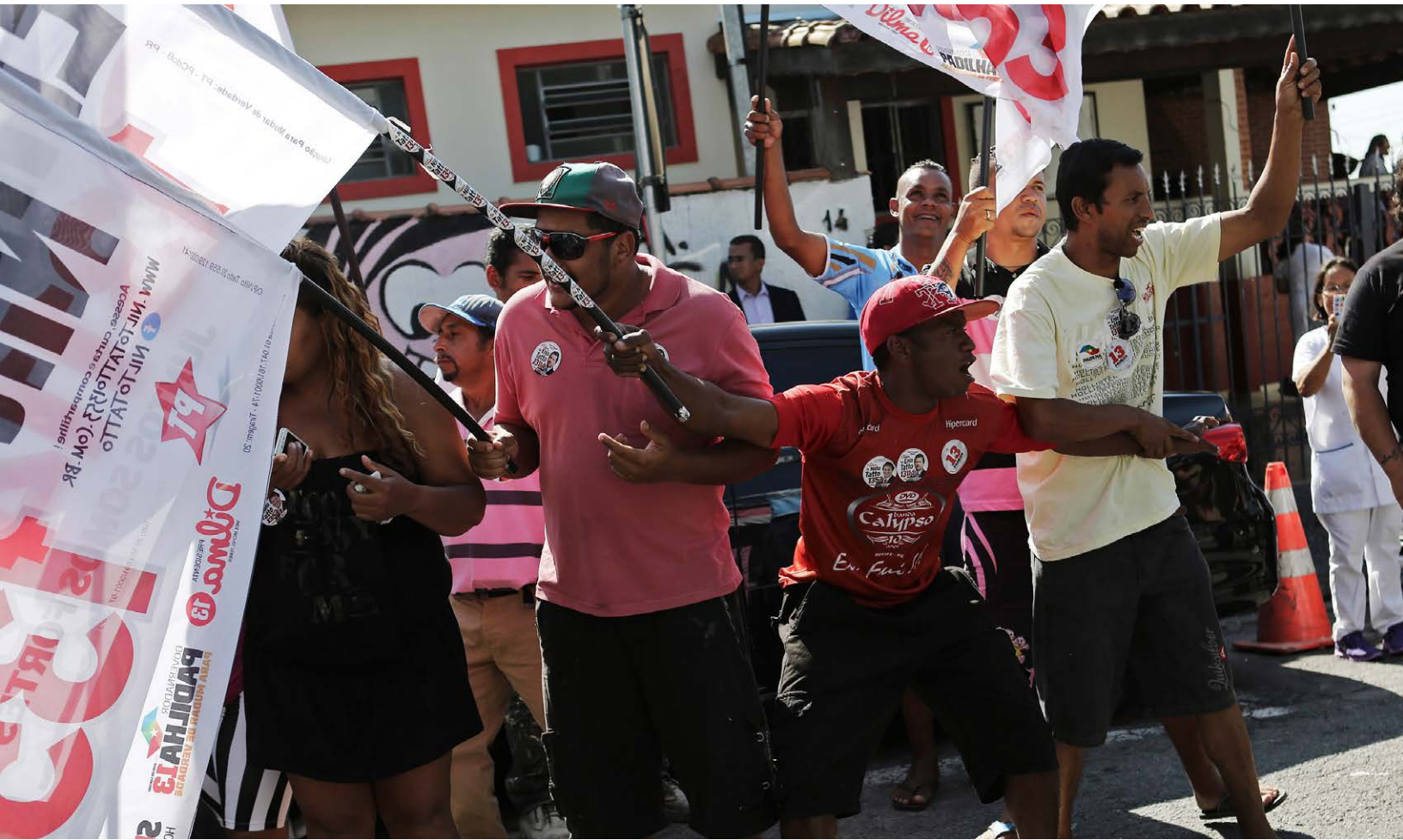
TIGHT RACE: Dilma supporters (top) hold flags during a campaign rally in Sao Paulo, while a boy (below L) shows Silva and her vice-presidential candidate Beto Albuquerque how to shoot a basketball. A youth (bottom R) plays a tambor during an Afro-Brazilian culture celebration marking the anniversary of the abolition of slavery, in Valenca, Rio de Janeiro.