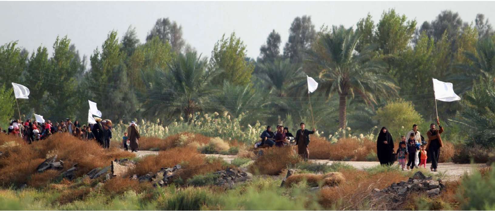
ESCAPE: Civilians surrender after Iraqi soldiers and Shi'ite fighters defeat Islamic State militants in Jurf al-Sakhar on October 27.