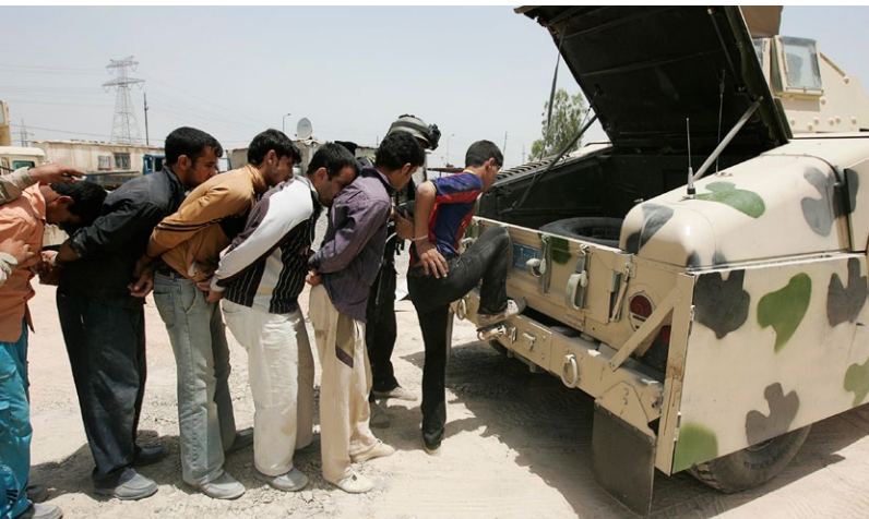
WARZONE: Iraqi security forces detain suspected Islamic State militants (above), during an operation in Jurf al-Sakhar in May. Iraqi Soldiers were still battling in the area a month later (right), around the time Shi'ite fighters (below) joined the fight.