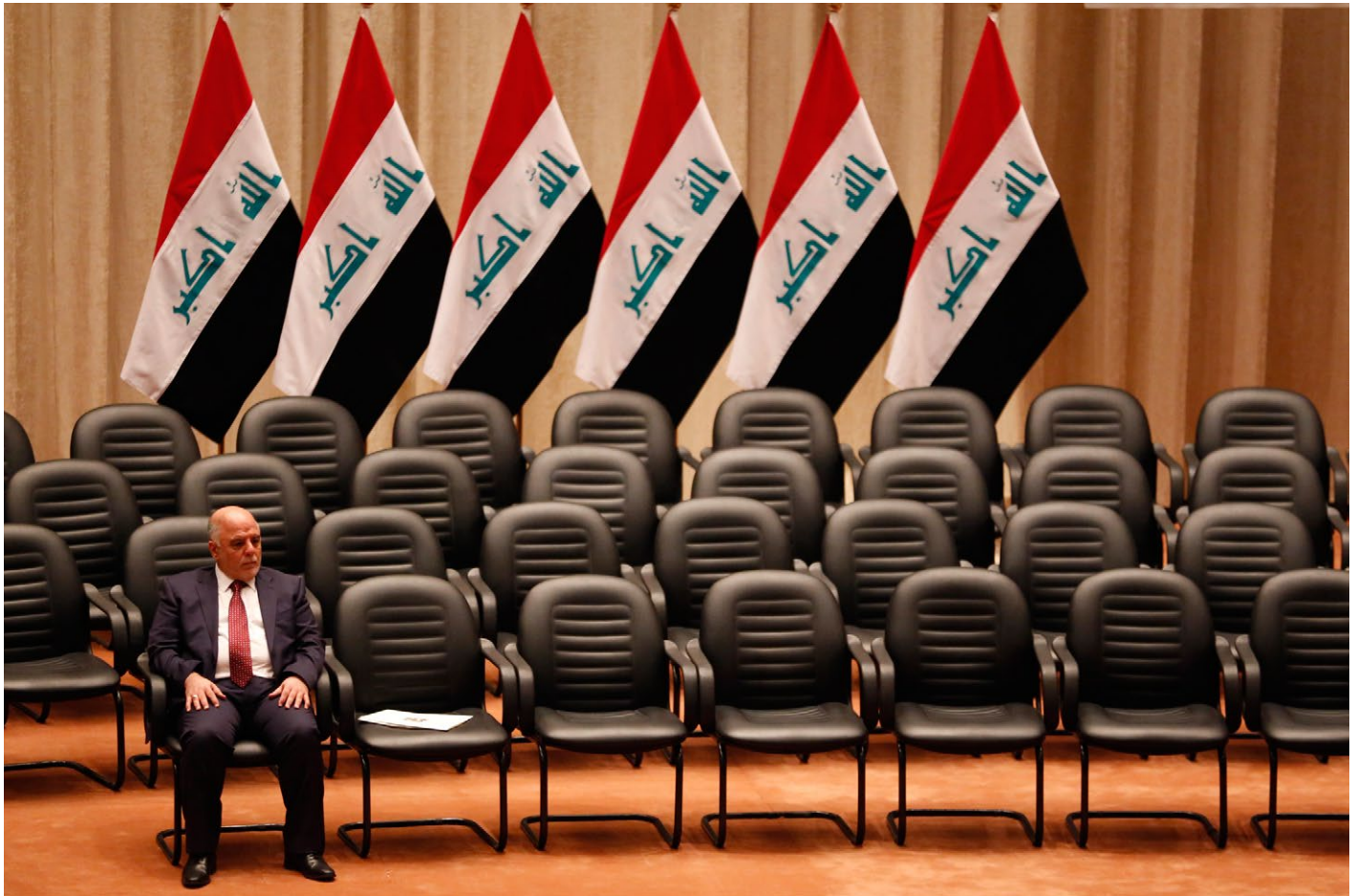
ON THE EDGE: Iraqi Prime Minister Haider al-Abadi, seen above in September, is trying to defeat the militant group Islamic State while remaining in control of government-backed Shi'ite militias. On the cover, Abu Hussein, a farmer from south of Baghdad, holds a picture of his ransacked house. He and hundreds of neighbours fled their village after they were caught in fighting.