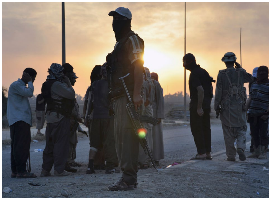
ON GUARD: Islamic State fighters at a checkpoint in Mosul in June soon after they seized Iraq’s second biggest city.

The militants also took 200 chickens and 36 prized pigeons.