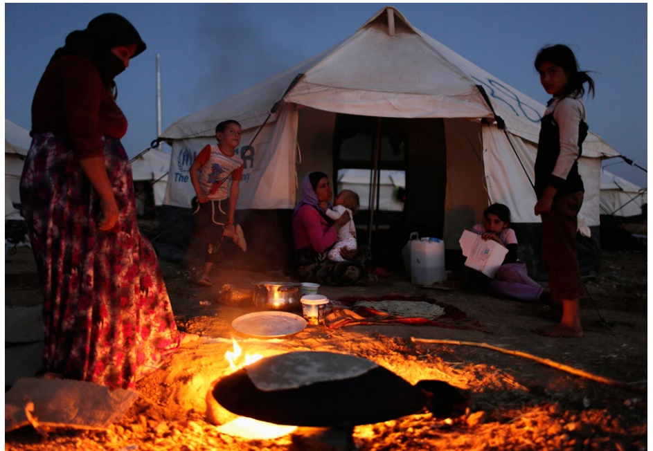
STAPLE: A Yazidi woman makes bread at Bajed Kadal refugee camp in August.

Abdel Rizza Qadr Ahmed, head of the silo, believes that IS forced local farmers to mix wheat produced in other, IS-controlled areas into their own harvest. The farmers then sold it to Makhmur as if it all had been grown locally. In the weeks before the