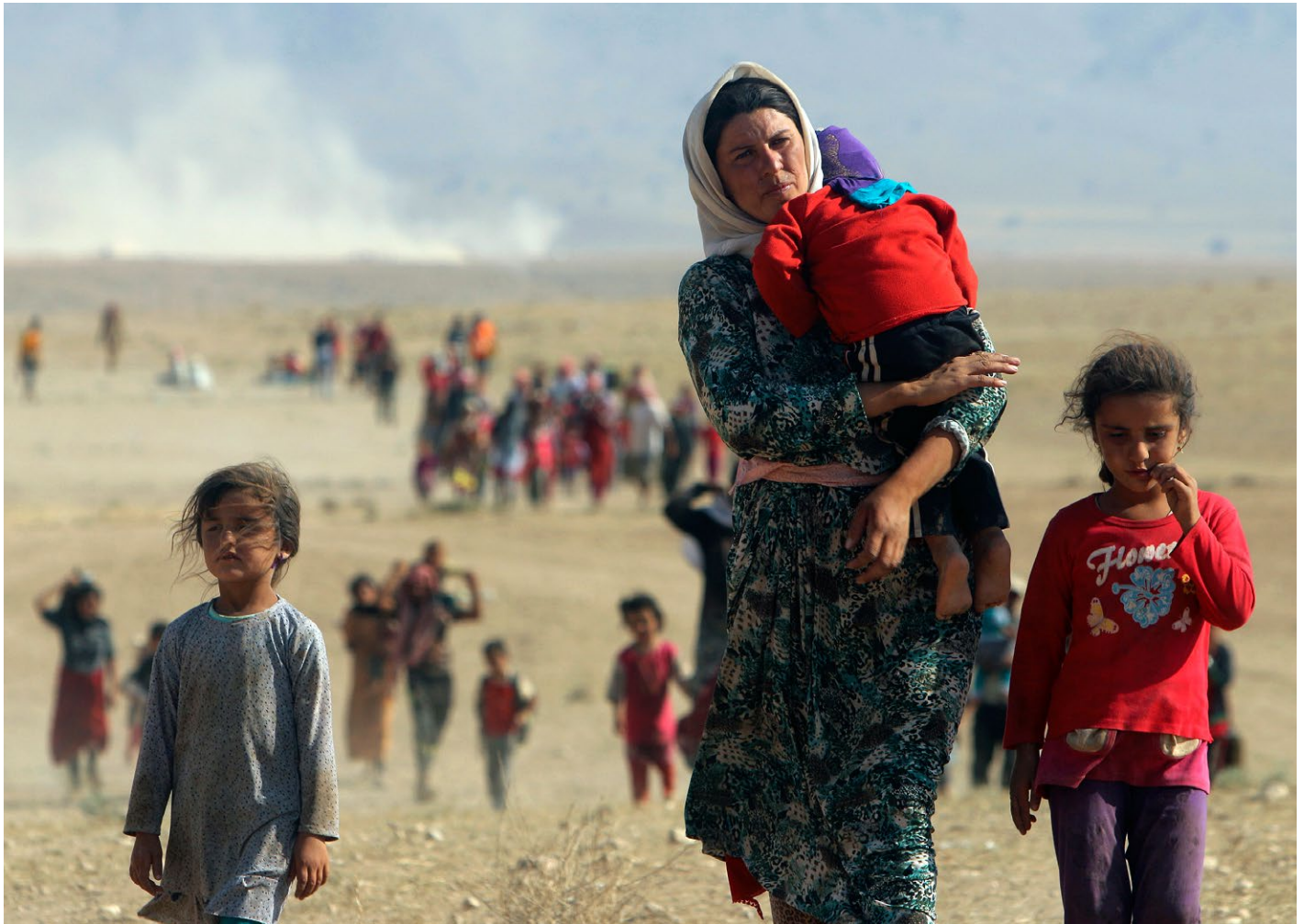
FORCED MOVEMENT Displaced Yazidis flee forces loyal to the Islamic State in Sinjar town in August.

Arab farmers. Those who have remained on their land just outside IS-held territory fear the militants will soon take their villages, and their harvested but unsold crops.