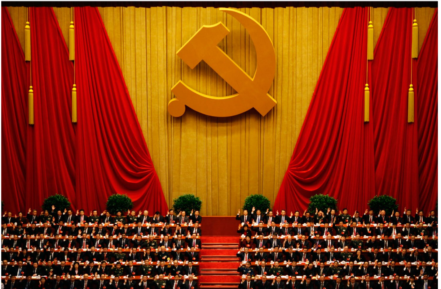
PARTY PLOTTING: Zhou plotted to get his own men in power in the run-up to the 2012 Communist Party Congress to choose a new leadership team, so he could pull strings behind the scenes, Reuters sources close to the leadership say.

ally, the former Chongqing party chief Bo Xilai, who recanted his earlier confessions and protested his innocence during a five-day trial, according to a person with leadership ties. Bo was jailed for life for corruption.