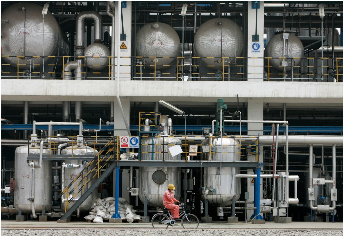
PETRO-PURGE: Xi's corruption probe has focused on China's sprawling state-owned oil industry, which Zhou once oversaw as head of China National Petroleum Corporation.

news agency reported on August 14 that 23 of these officials had been charged. Many of them have no apparent link to Zhou.