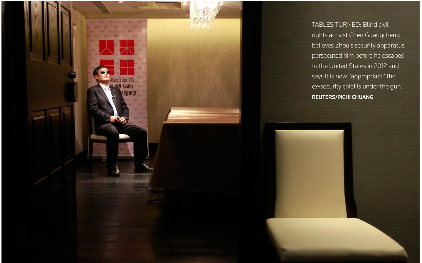
TABLES TURNED: Blind civil rights activist Chen Guangcheng believes Zhou's security apparatus persecuted him before he escaped to the United States in 2012 and says it is now "appropriate" the ex-security chief is under the gun.