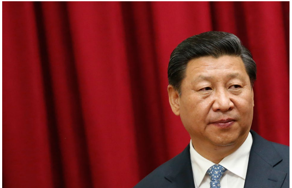
HUNTING TIGERS: President Xi Jinping has launched the biggest corruption crackdown since the communists came to power in 1949, going after "tigers" or high-ranking officials as well as "flies".

Xi and his allies are still uncertain how far they can go in their bid to eliminate the threat from a rival who once controlled China's pervasive security apparatus and built a sprawling network of patronage