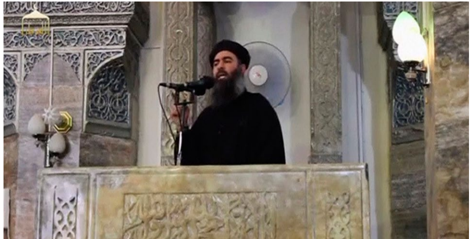
SPEECH: A man purported to be reclusive Islamic State leader Abu Bakr al-Baghdadi in his first public appearance at a Mosul mosque on July 5. The Iraqi government said the video was not credible. It was not possible to confirm the authenticity of the recording or when it was made.

In 2011, Maliki sent troops to Suleiman's