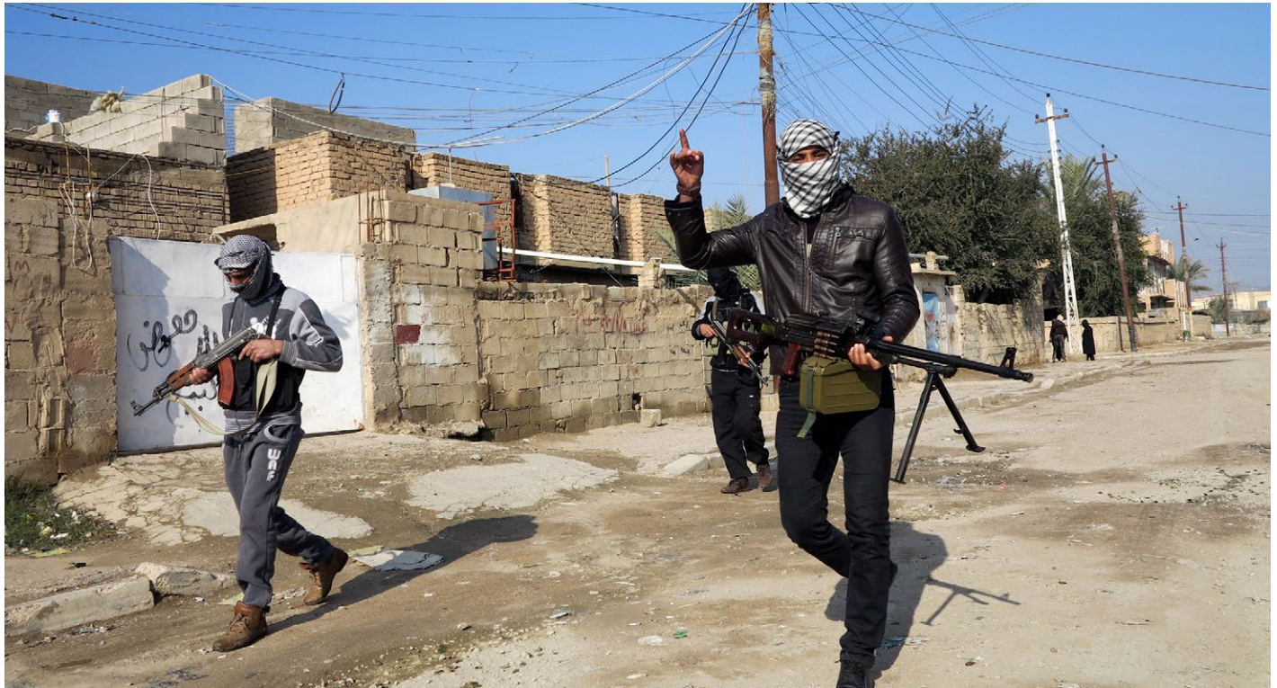
GUNMEN: Sunni fighters in Ramadi in January. Islamic State militants and more moderate Sunni nationalists remain united. But that may not last.