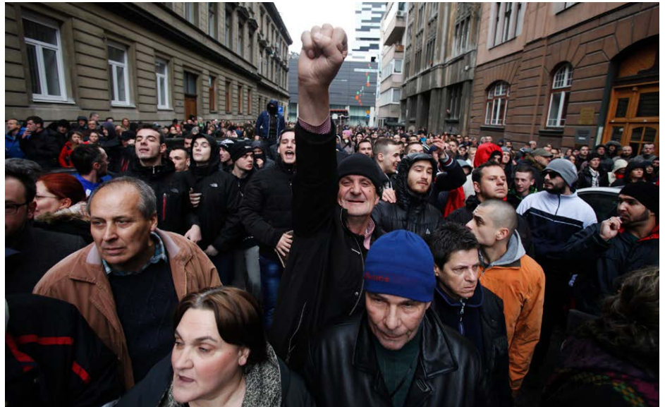
SOCIAL UNREST: Protesters chant slogans during a demonstration in Sarajevo against the Bosnian government in February. Anger over lack of jobs was a key factor behind the protests.

In May that year, the workers used a new legal avenue to claim unpaid salaries