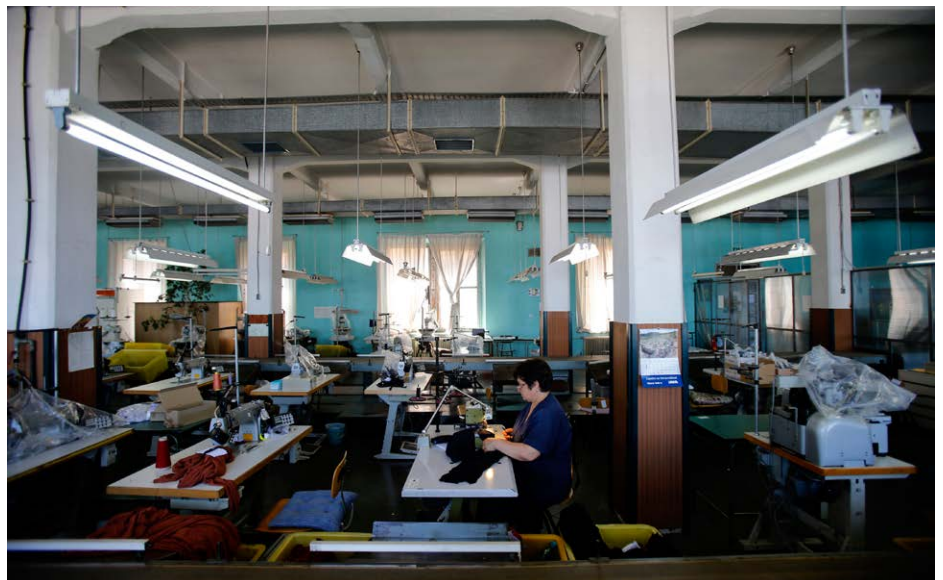
THREADBARE: A worker at Arena Modna Kuca clothing company in Croatia, where employees say salary payments have been erratic. The company did not respond to requests for comment.

Since jobs are scarce, thousands of workers in the countries spawned by Yugoslavia's bloody breakup in the 1990s regularly work for nothing - in the hope that employers will eventually pay up. The phenomenon is growing in some places and contributing to social unrest in the region. Earlier this year protesters in Bosnia torched government