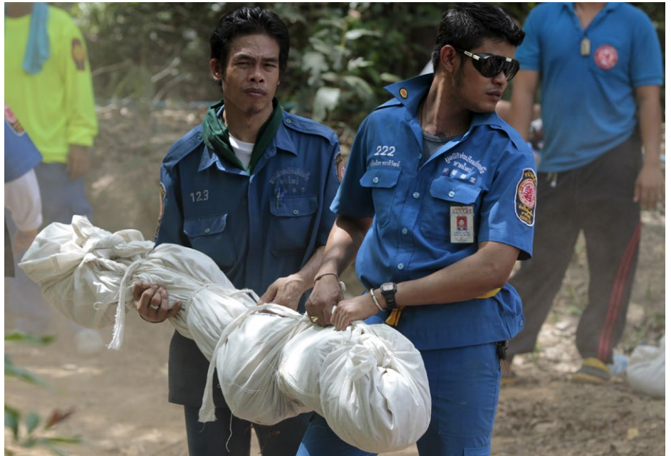
GRISLY DISCOVERY: Thai police retrieve the remains of suspected victims of trafficking in southern Thailand.