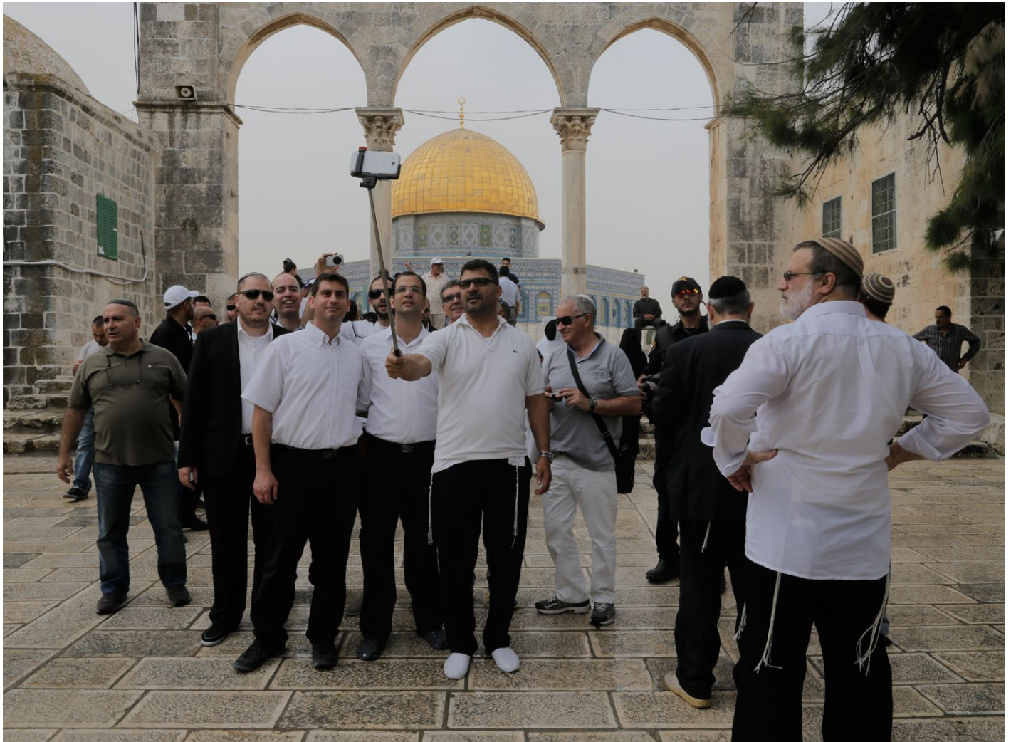
SELFIE STICKS: Right-wing Jewish activists during a May visit to the compound.