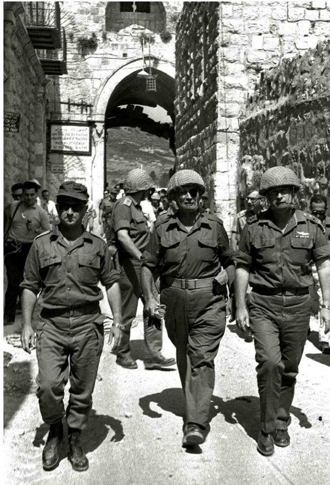
SIX-DAY WAR: Defence minister Moshe Dayan (centre) walks with General Uzi Narkiss (left) and Chief of Staff Yitzhak Rabin after Israel captured the Old City in June 1967

The Waqf says things really began to shift from September 2000, when Ariel Sharon, then Israel's opposition leader, visited Temple Mount with a large delegation just before an election. Many Palestinians