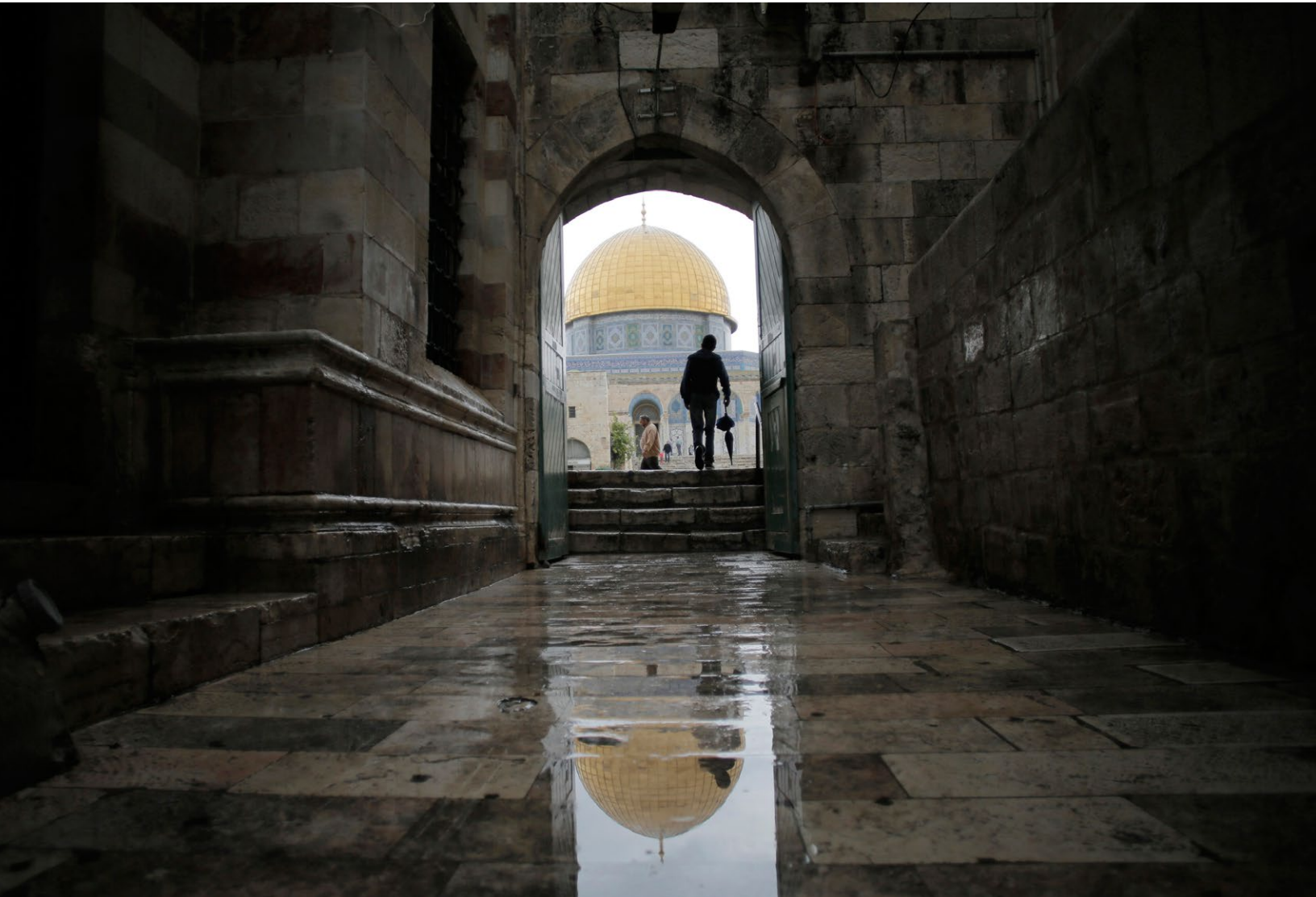
ENTRANCE: The Dome on the Rock, seen through one gate to the compound that is sacred to both Muslims and Jews.

of worship for all religions in Jerusalem. Believers pray at their holy sites not in spite of our rule in the city, but precisely because of it.”