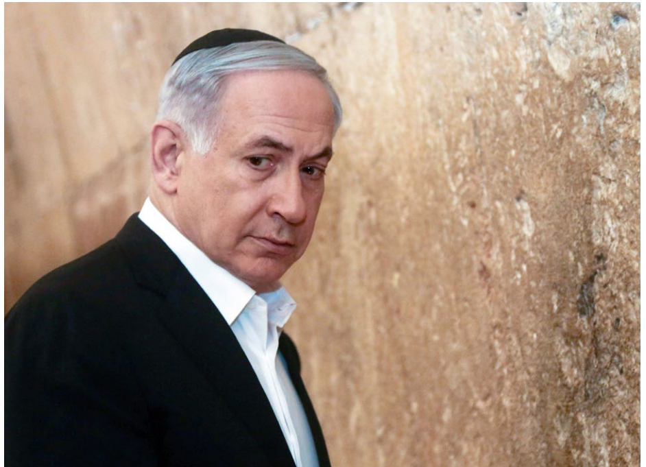
CHALLENGE: Prime Minister Benjamin Netanyahu at the Western Wall, Judaism's holiest prayer site, in February. Netanyahu has repeatedly said the status quo should remain.

“ The Third Temple, which will be a house of prayer for all nations, will be built very soon.