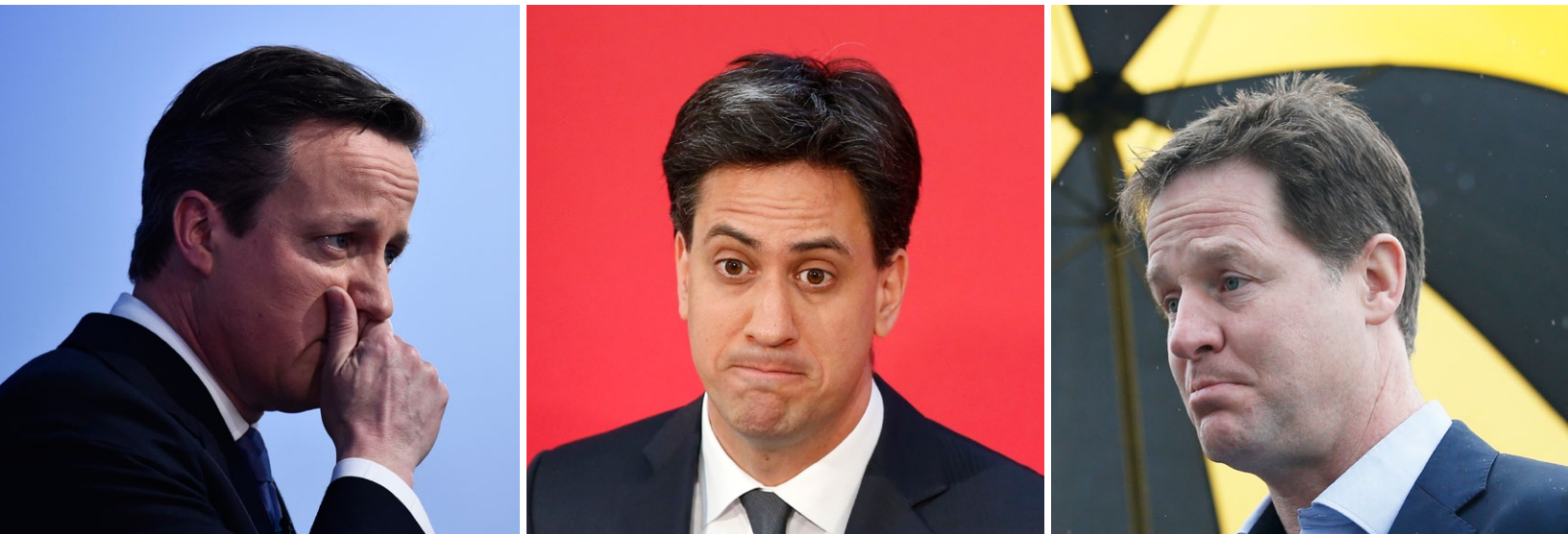
STUMPED: Neither Conservative Prime Minister David Cameron, left, nor Labour leader David Miliband, centre, look like winning a majority in the May 7 election. The Liberal Democrat leader Nick Clegg, right, may even lose his seat in parliament.

me to give them crystal clear assurance that Labour won't go into coalition with the SNP."