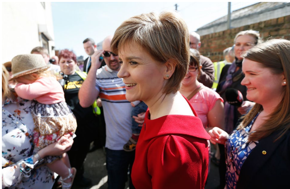
ON A ROLL: Nicola Sturgeon, leader of the Scottish National Party, has such strong support she is likely to have a powerful say in who forms the UK's next government. Cover: Clouds gather over Big Ben, the clock tower at Britain's Houses of Parliament.

UKIP is not the only deep fissure in Britain's political landscape. The Scottish National Party, which won just 1.7 percent of the vote and six parliamentary seats in 2010, is enjoying a surge in popularity. Polls suggest it could win more than 40 of the 59 seats Scotland has in the national parliament. That would likely give the SNP a powerful say in who forms the next government. England's 38 million voters may find themselves at the mercy of Scotland's 4 million.