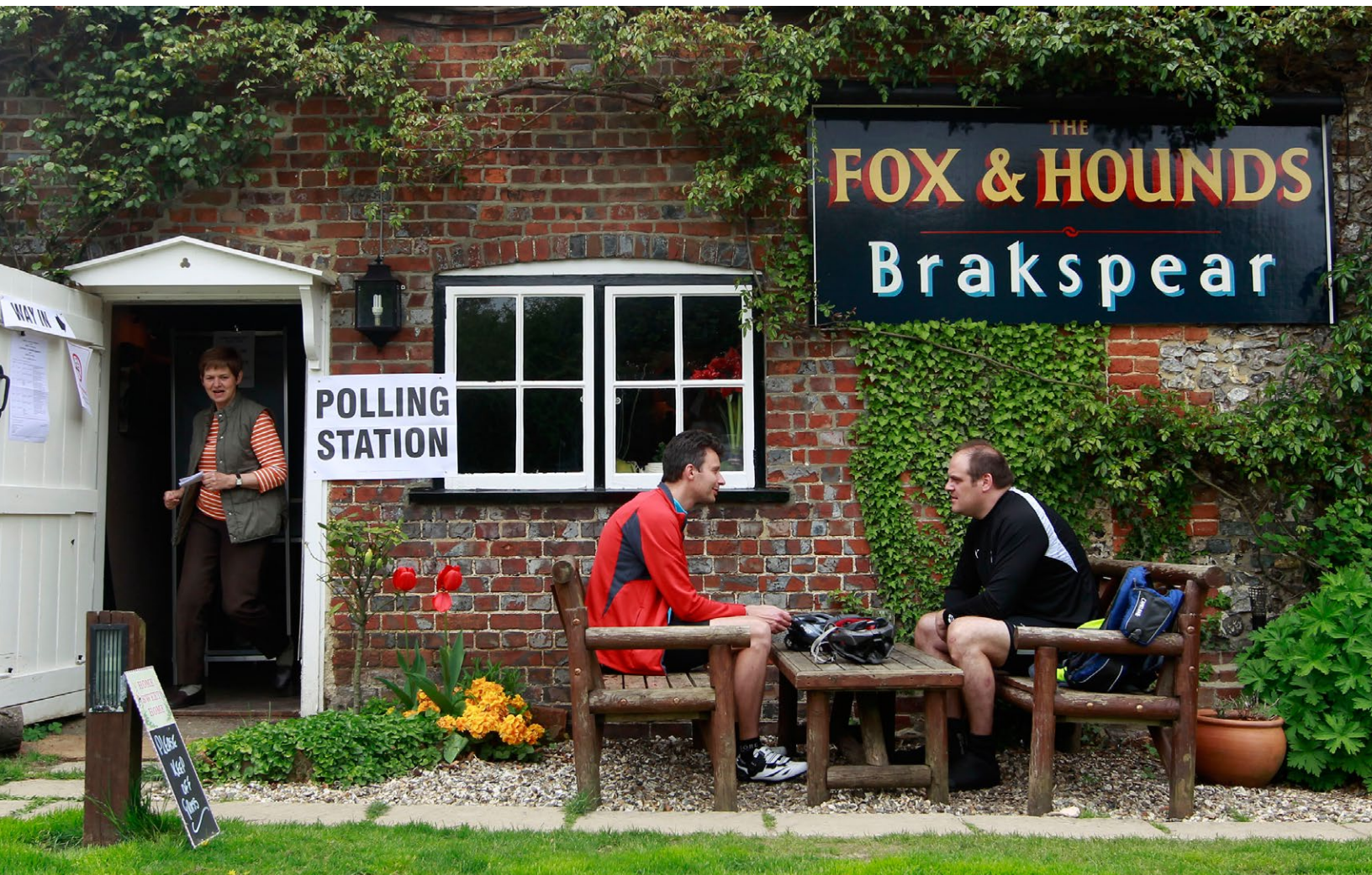
REFRESHING THE GOVERNMENT: A polling station set up in a pub in southern England in 2010. After five years of a Conservative-Liberal Democrat coalition, Britons will vote again next month on who they want to run the country.

“constitutional convention” to thrash out all the issues.