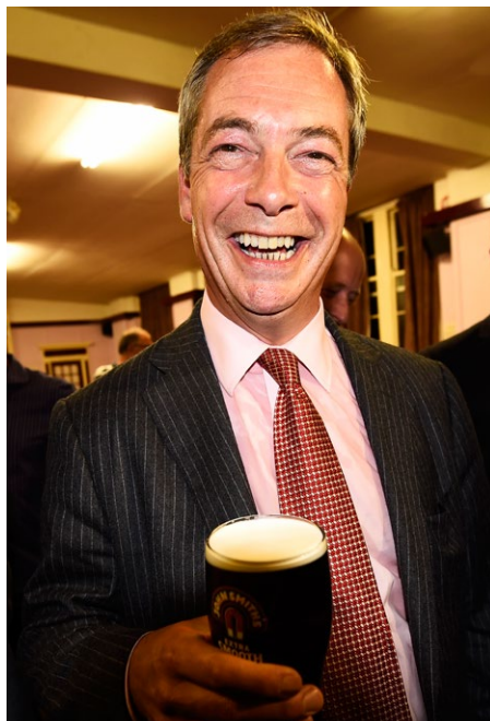
SALOON BAR POPULIST: Nigel Farage, leader of the United Kingdom Independence Party, has taken support from both the Conservatives and Labour by espousing nationalist policies.

Former deputy leader of the Labour Party