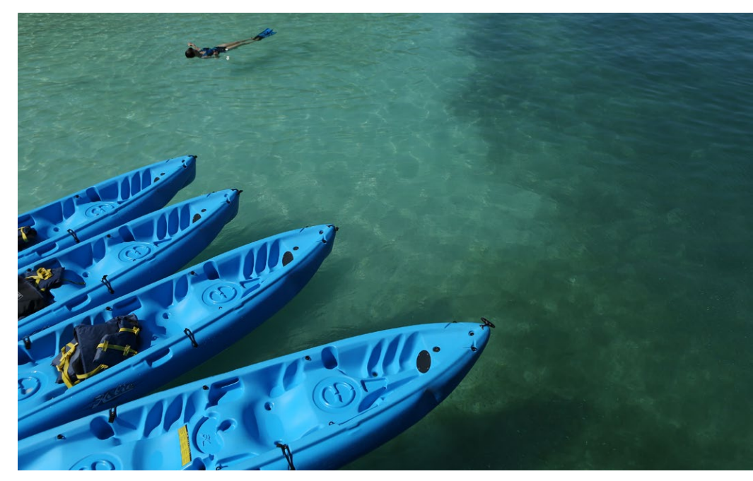
BERMUDA TRIANGLES: Bermuda is a popular offshore jurisdiction. The combination of an offshore entity, a trust, and non-domiciled status puts British-grown wealth out of reach of the UK tax authority.

Harrods funded a lavish, largely untaxed lifestyle for Fayed and his family. In the 1990s, the tax authority alleged that "enormous dividends" from Harrods went offshore, and that Harrods covered the cost of family expenditure without Fayed paying