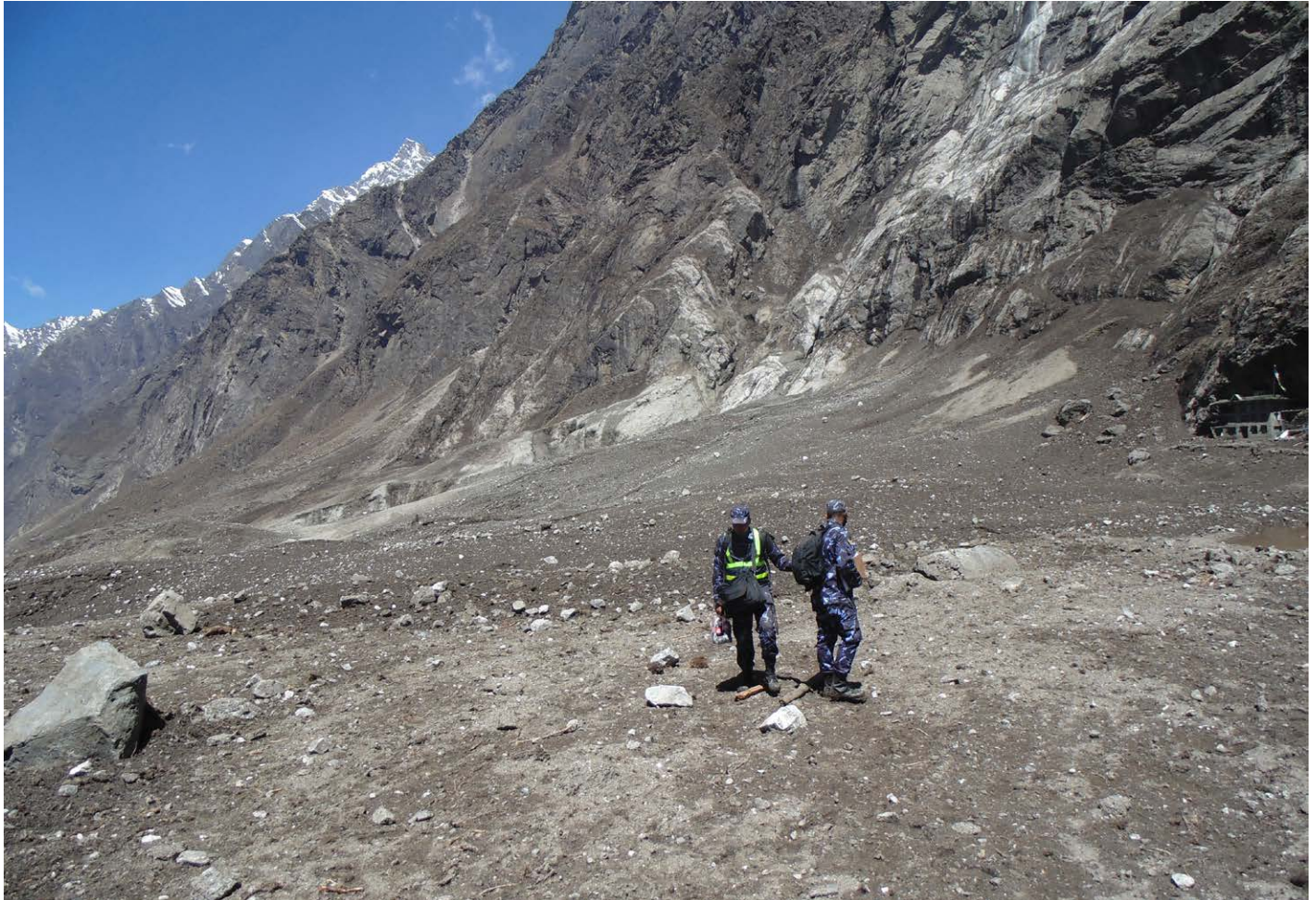
AFTERMATH: Soldiers search for victims. Roughly 300 people, including some 110 foreigners, are believed to lie buried beneath six meters of debris.