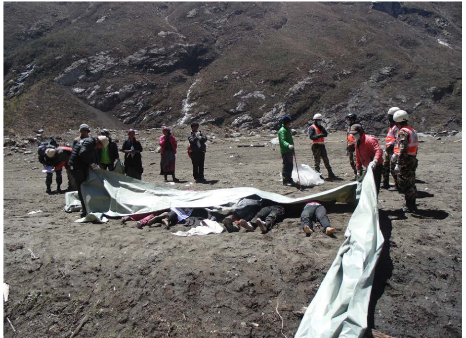
INTERRED: More than 300 trekkers and villagers are believed to be buried under six metres of rock, snow and ice from the April 25 Langtang Valley avalanche.

The stunning landscapes of Langtang Valley, the nearest Himalayan region to