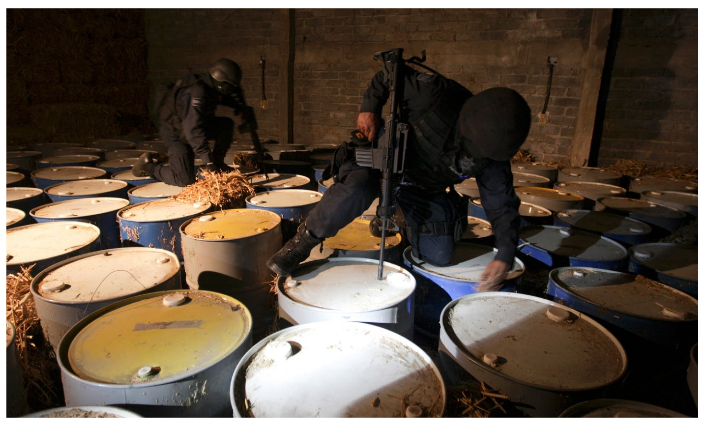
FORCES NEEDED: America's Drug Enforcement Administration (DEA) is helping African officials detect and dismantle clandestine labs. In this 2009 picture, federal policemen raid a Mexican cartel.