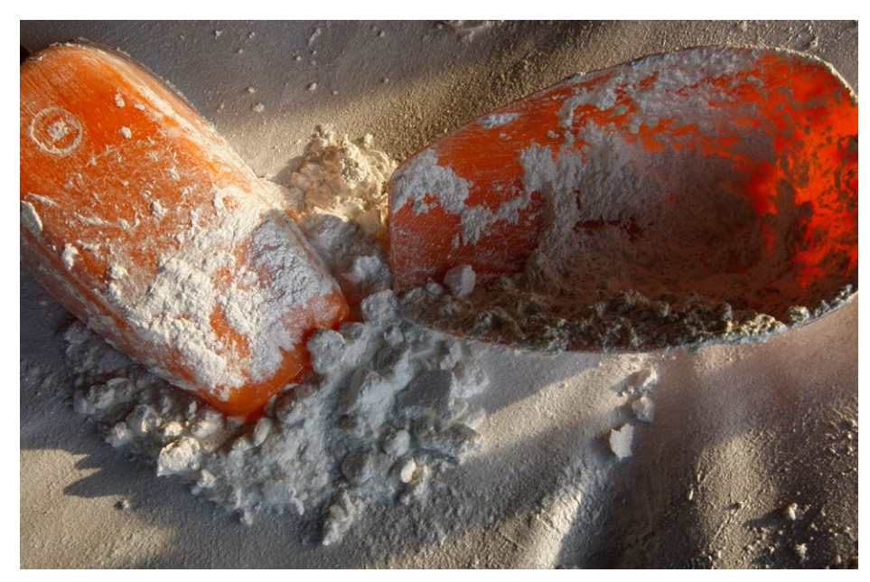
MEXICAN CONNECTION: Latin American gangs are providing know-how to West Africa based on clandestine labs like this one in Zacoalco de Torres, Mexico, in 2011. Cover: Methamphetamines seized by police at the Malian border in Senegal in 2014.

Climate dictates where cocaine, heroin or hashish are produced, but there are no such constraints on meth. The synthetic drug is derived from ephedrine or pseudoephedrine, two medicines that are used to treat ailments from nasal decongestion to asthma. As anyone who has seen the television series "Breaking Bad" knows, meth can be manufactured even with basic equipment and a simple understanding of