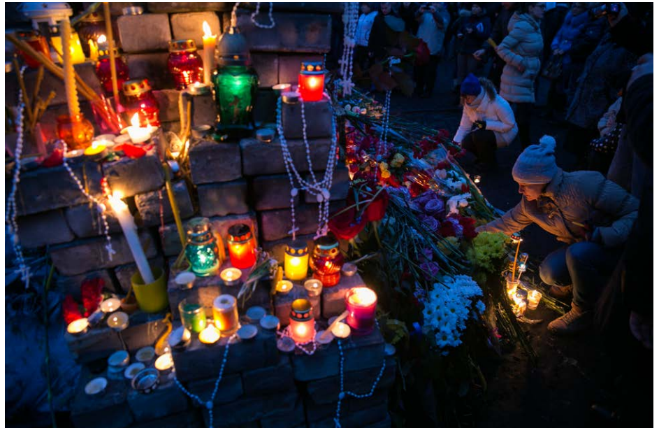
"HEAVENLY HUNDRED": Lighting candles for fallen protesters in the Maidan on Feb. 23. More than 100 protesters died in the uprising. Today they are known as "the Heavenly Hundred."

The prosecutors "represent the whole picture as a peaceful protest," Sadovnyk told a judge at a hearing on Sept. 5. But, he added, "On the 20th, early in the morning, as a result of the peaceful protest, nearly 17 representatives of law enforcement were killed."