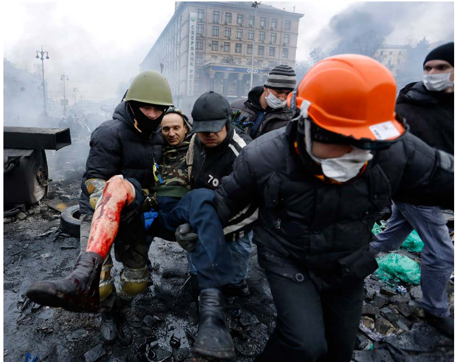
HISTORIC MOMENT: Protesters carry a comrade from the Maidan on Feb. 20. Scores of protesters died that day. Thirteen police were killed in February.