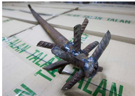
AFTERMATH: Members of the disbanded Berkut riot police say this police shield (top) was pierced by bullets and burned by a Molotov cocktail. Protesters, they say, improvised weapons such as the one at left.

could prejudice the cases. Ukraine is a party to the European Convention on Human Rights, which states that criminal defendants are presumed innocent until proven guilty.