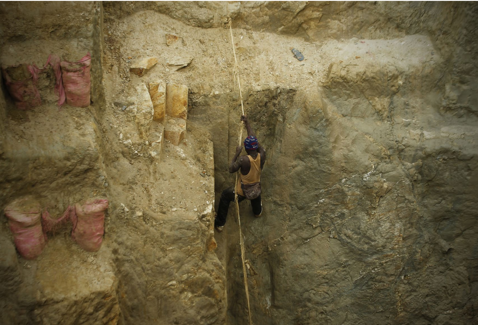
GOING DEEP: Gold miners at Gamina have dug dozens of metres into the earth.

declared to the U.N., a likely violation of the embargo.