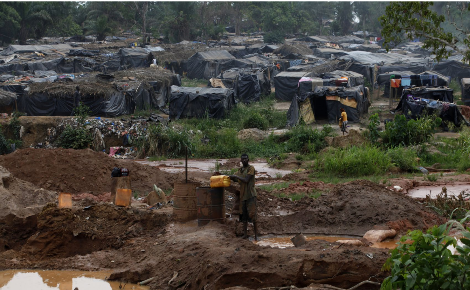
GOLD CITY: Thousands of artisanal workers prospect the sprawling mine at Gamina, living in a makeshift camp and hauling bags of dirt and rock to be sorted. For the lucky, the rewards can be huge.