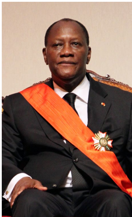
INCUMBENT: Ivory Coast President Alassane Ouattara, here during his inauguration ceremony in May 2011, will run for re-election in October.