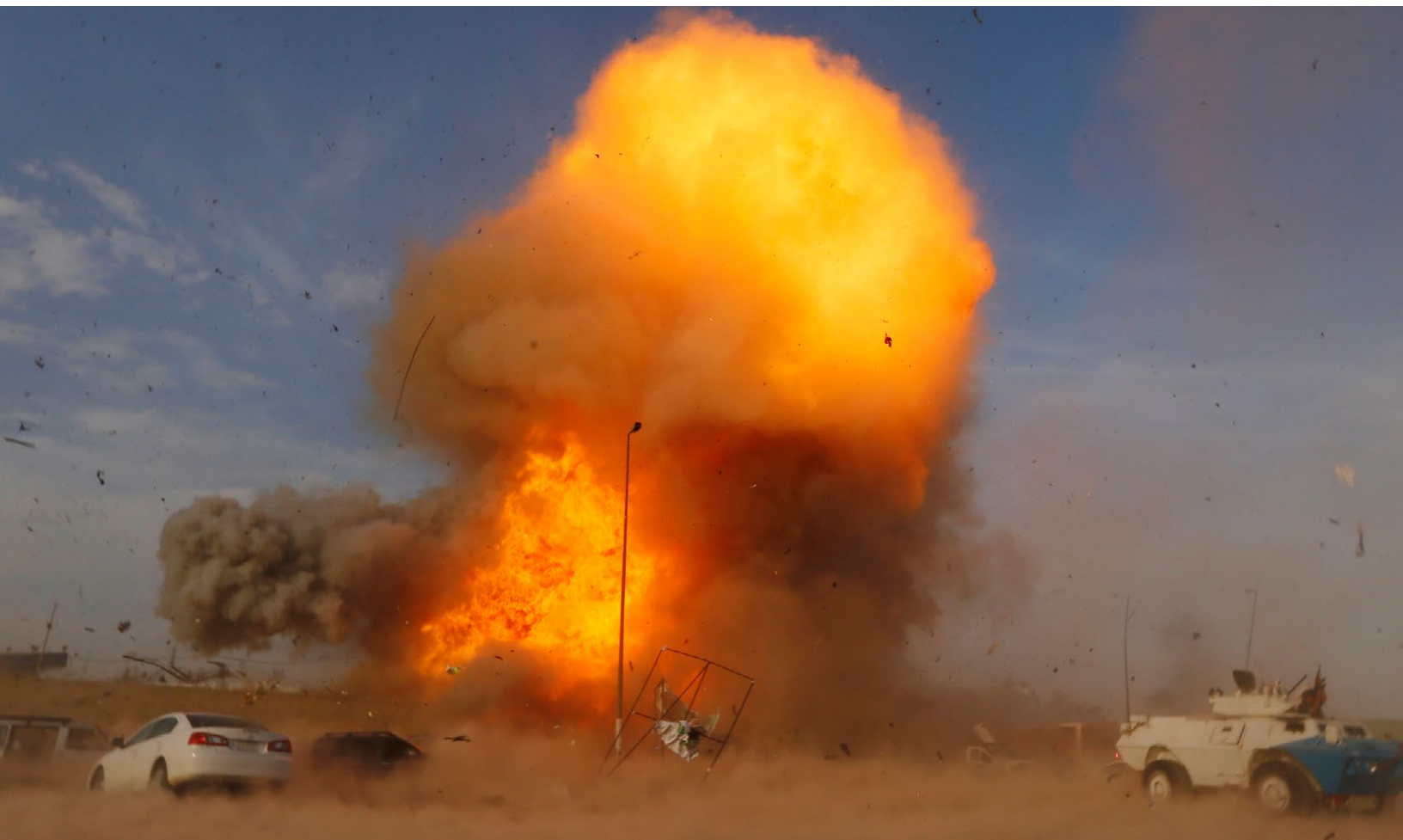
SCENES FROM A COUNTRY DIVIDED: (Clockwise from above) A car bomb attack at a Shi'ite political rally in Baghdad in April; Iraqi security forces arrest suspected Islamic State militants in Hawija in April; Iraqi security forces clash with Islamic State militants in Babel, also in April. On the cover: The aftermath of a car bomb attack in Baghdad's Sadr City district in August.