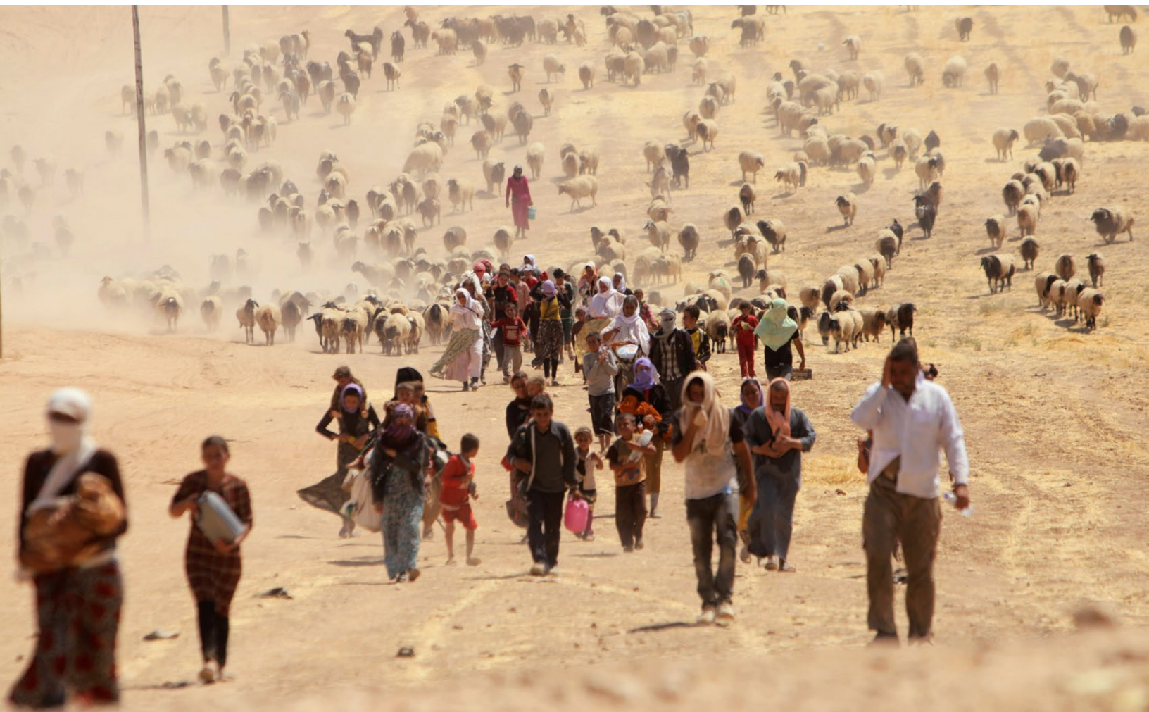
EXODUS: (Clockwise from above) Displaced people from the minority Yazidi sect flee Islamic State forces in Sinjar in August; A Kurdish Peshmerga fighter keeps guard in Gwar in September; Displaced Iraqis arrive in Sulaimaniya in August.