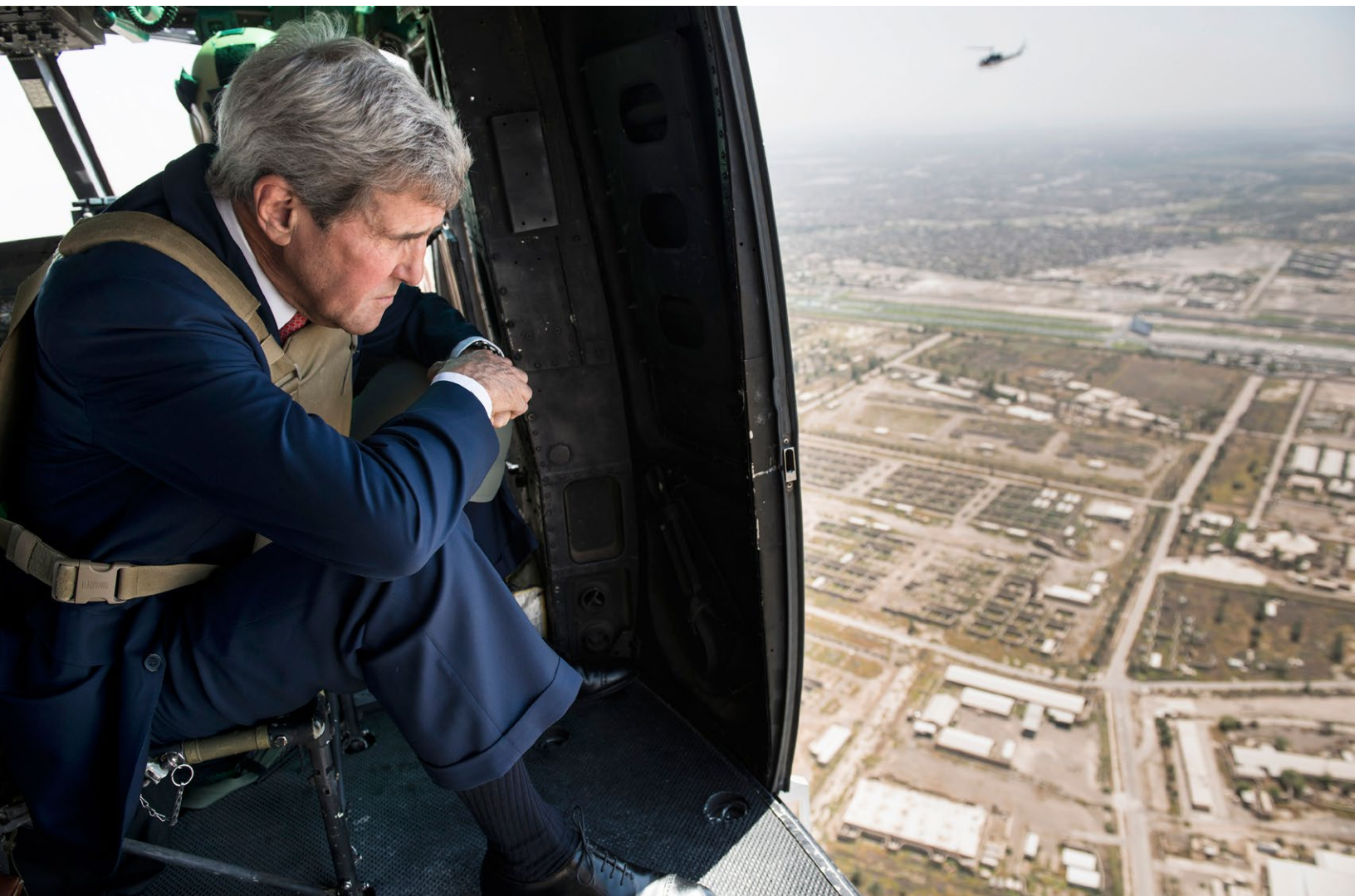
FROM ABOVE: U.S. Secretary of State John Kerry flies over Baghdad in September. Washington has given military, political and financial support to Iraq to defeat Islamic State militants.

decorated with images of Iran's supreme leader Ayatollah Ali Khamenei.