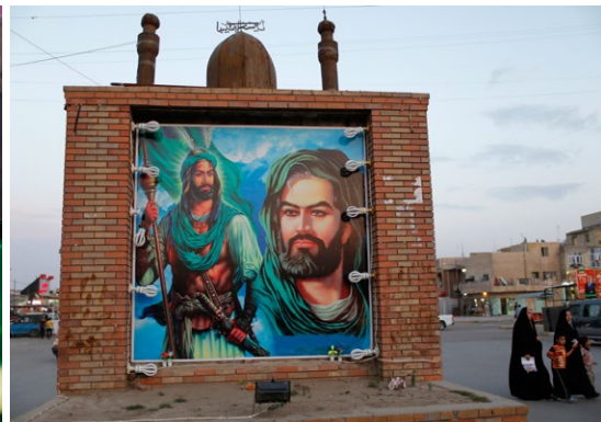
DAILY LIFE: (Clockwise from above left) An outdoor cafe in Sadr City, a Shi'ite neighbourhood in Baghdad, in April; Men play snooker in Sadr City; Shi'ite women walk past a religious poster in May; Students play at a Sadr City Islamic school in May.